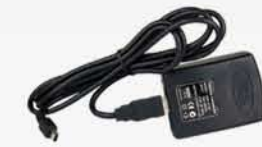
AC Travel Charger & USB Data Cable