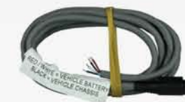
Mobile Mount DC Power Cable