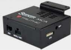
Mobile Communications Adapter