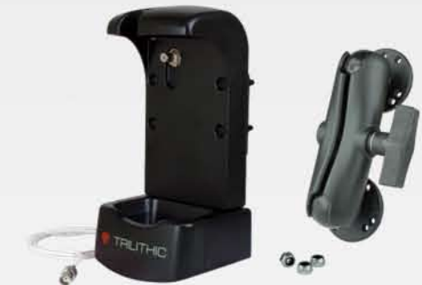
Mobile Mount & Arm (Includes Hex Nuts x 3)