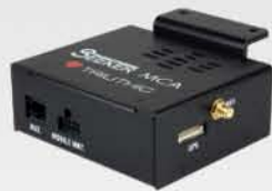
Mobile Communications Adapter