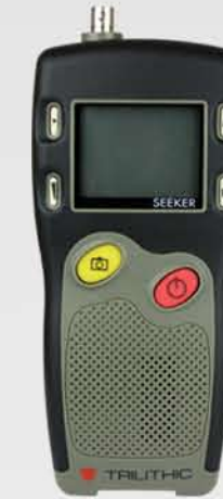
Seeker Leakage Detector