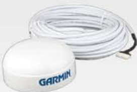
Serial (RS-232) GPS Receiver