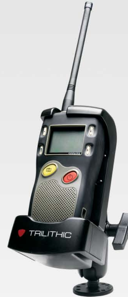
Seeker Assembled View